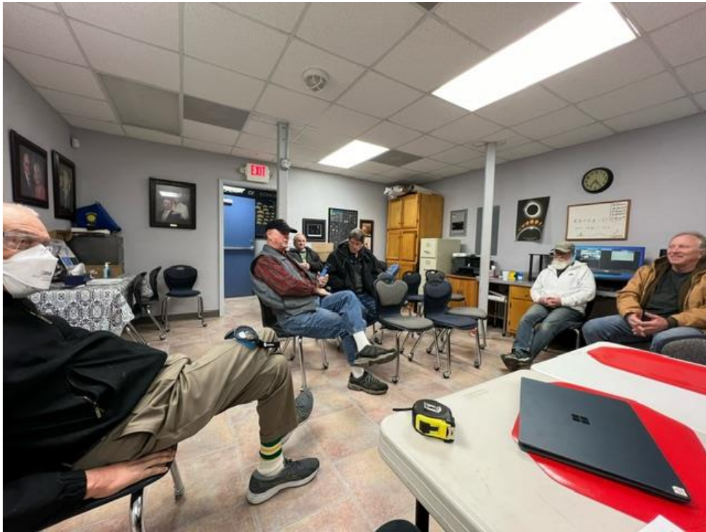
Betty Smith Memorial Observatory planning meeting inside PJMO 2024