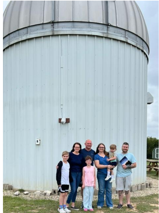
All ages...Clifton & Midland Family at PJMO!