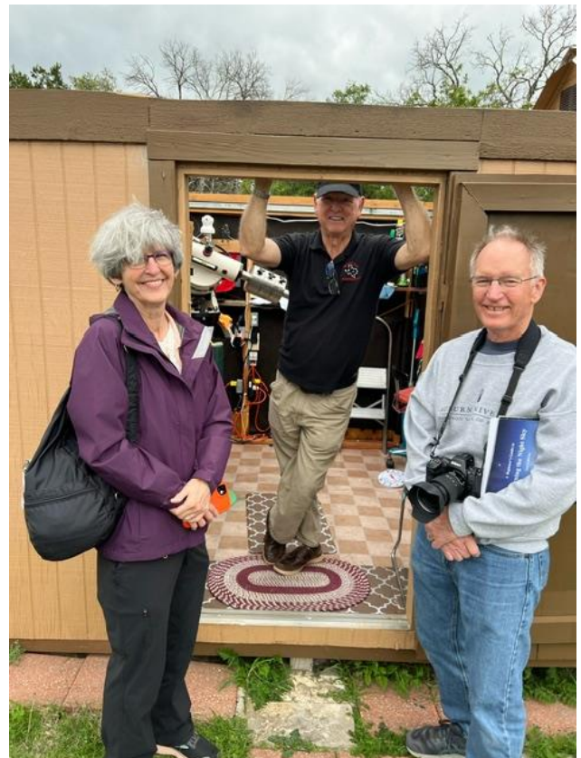
NTAC Couple outside "Brickhouse" observatory will return with Granschildren in the summer to see the Milky Way!