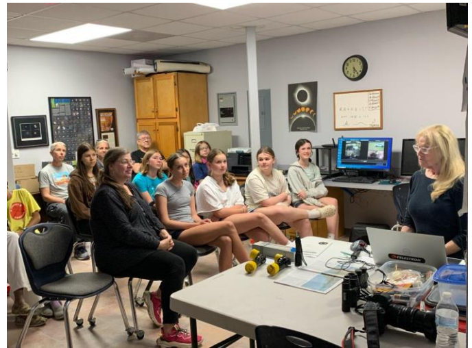
Girl Scouts of Central Texas Earning Badges