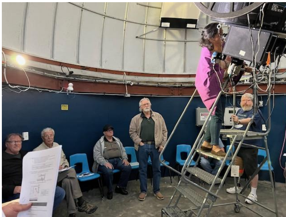
PJMO Remote Telescope Member Training 2023