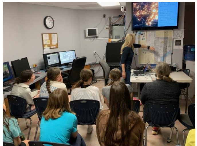
Girl Scouts learning about Dark Skies