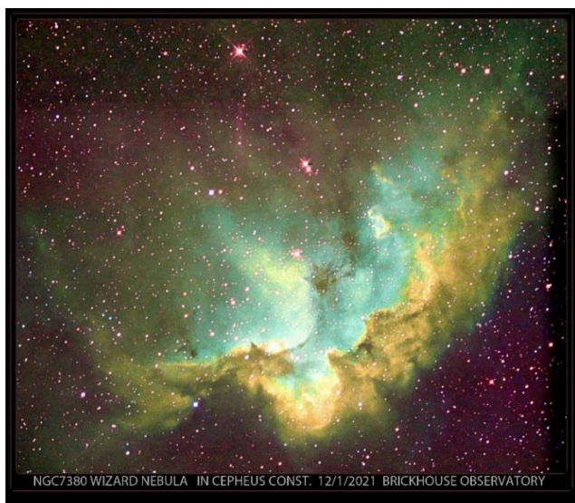
The Wizard -Astrophotography by Aubrey Brickhouse